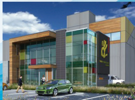
Tricentris, Lachute Félix-Touchette Road, Lachute, Quebec, Canada