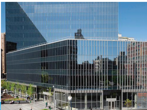
51 Astor 25 Cooper St, New York, NY 10034, United States