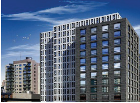
444 10th Avenue North New York, NY 10001. USA

We are proud supplier for the following completed and on going projects :