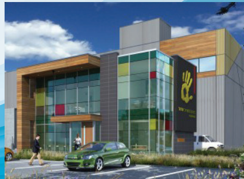
Tricentris, Lachute Félix-Touchette Road, Lachute, Quebec, Canada