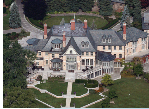
Edgemere 1502 Lakeshore Road E., Oakville, Ontario, Canada