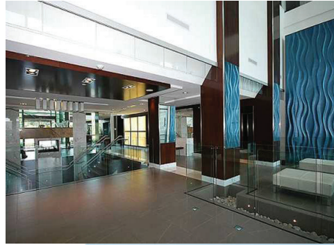
The West Mall 25 The West Mall, Toronto, ON M9C 1B8