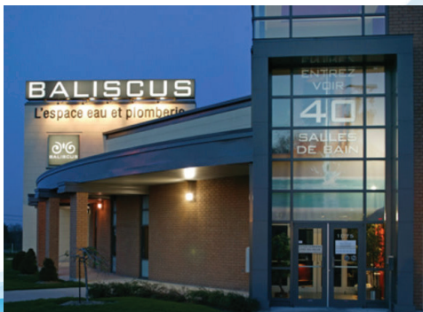
Baliscus 1075 Grand Héron Boul., Saint-Jérôme, QC, CA J5L 1G2