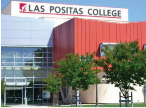
Las Positas College 3000 Campus Hill Dr, Livermore, CA, USA 94551

We are proud supplier for the following completed and on going projects :