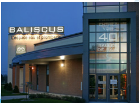
Baliscus 1075 Grand Héron Boul., Saint-Jérôme, QC, CA J5L 1G2