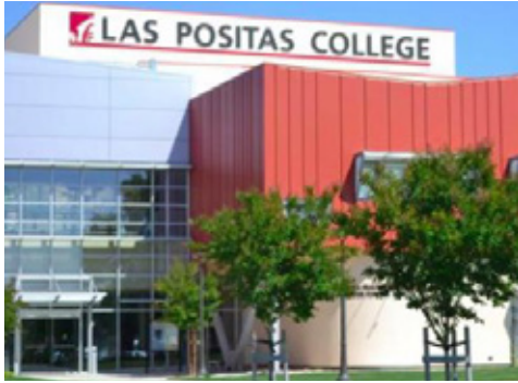
Las Positas College 3000 Campus Hill Dr, Livermore, CA, USA 94551

We are proud supplier for the following completed and on going projects :